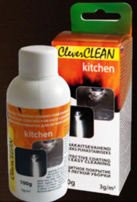
100g CleverCLEAN for Kitchen